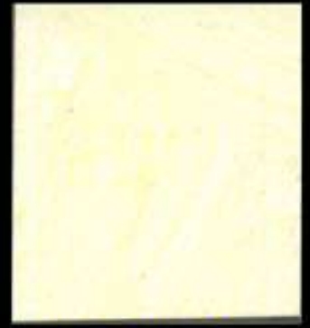
SH 2L0.5 + SH 3L0.5 C