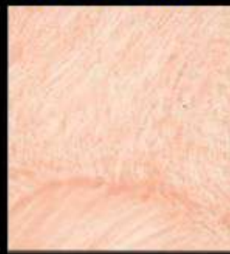
SH 5 L 0.5 + SH 8 L 0.5 B