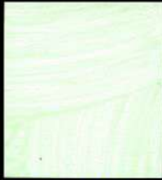
SH 3L0.5 + SH 5L0.5 C