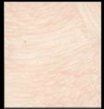
SH 8 C