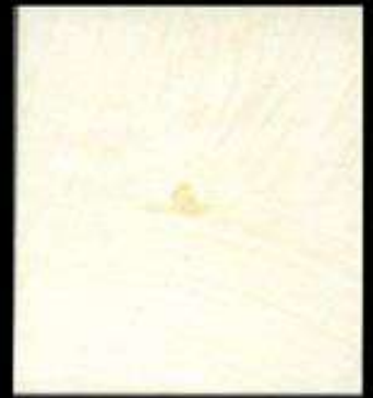
SH 4L0.5 + SH 6L0.5 D