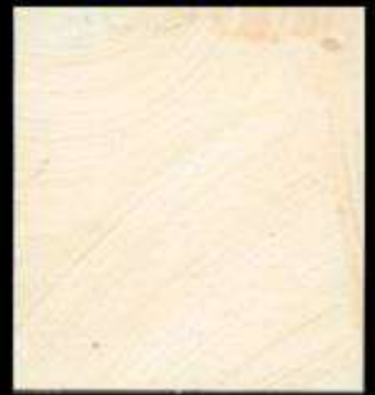
SH 4L0.5 + SH 6L0.5 B