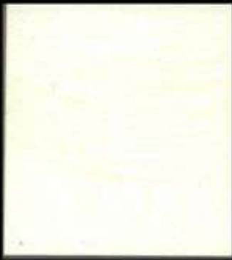
SH 5 D