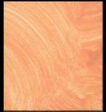
SH 4L0.5 + SH 6L0.5