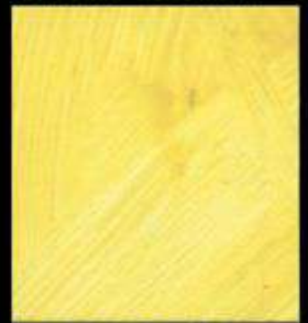
SH 2L0.5 + SH 3L0.5