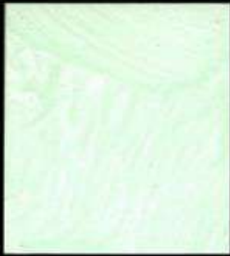
SH 3 D