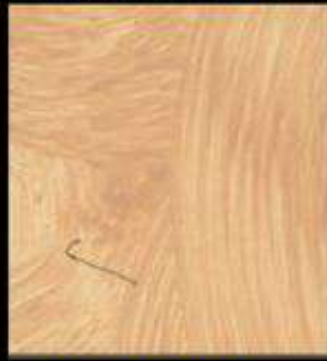
SH 4 L 0.5 + SH 7L 0.5 A