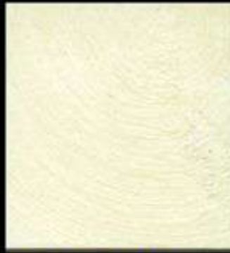
SH 1L0.5 + SH 5L0.5 C