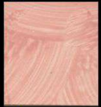
SH 8 A