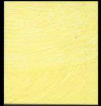
SH 2L0.5 + SH 3L0.5 A