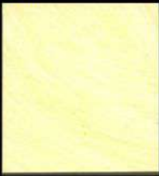
SH 5 B