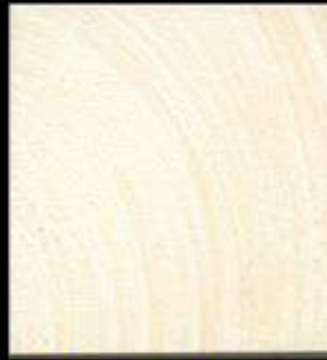
SH 4 L 0.5 + SH 7L 0.5 C