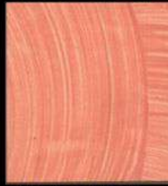
SH 5 L 0.5 + SH 8 L 0.5