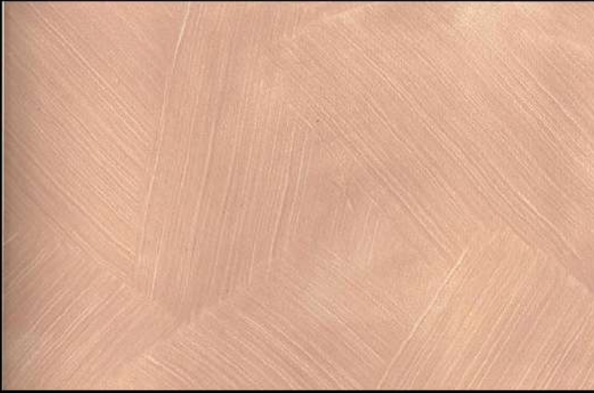
Shadows (Brush), Shade No. SH4+7