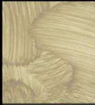
SH 1L0.5 + SH 5L0.5