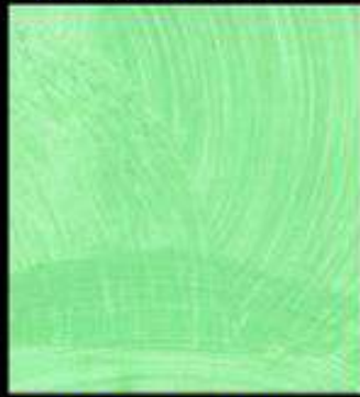
SH 3L0.5 + SH 5L0.5 A