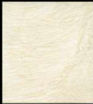
SH 7 D