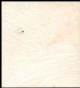
SH 6 C