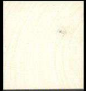
SH 4L0.5 + SH 6L0.5 C