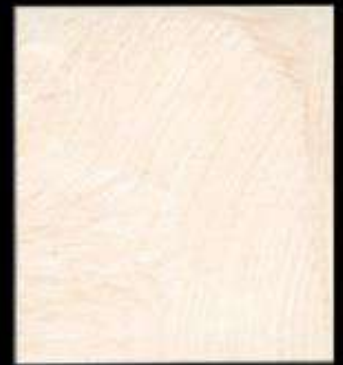
SH 8 D