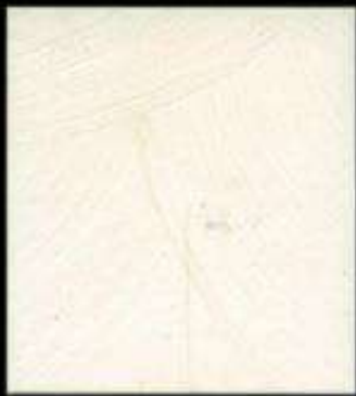
SH 6 D