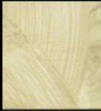
SH 1L0.5 + SH 5L0.5 A