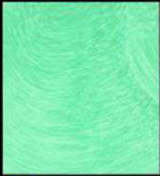
SH 3 A