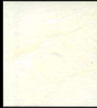
SH 4 D