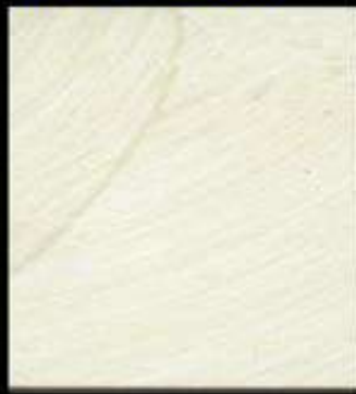
SH 1L0.5 + SH 5L0.5 B