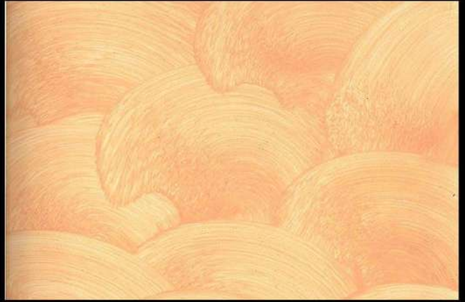
Shadows (Foam), Shade no. SH4+6