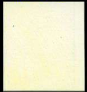
SH 2L0.5 + SH 3L0.5 B