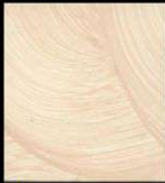
SH 7 C