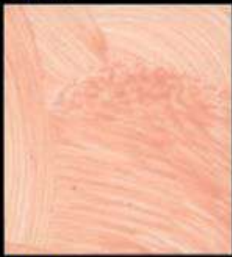
SH 6 A