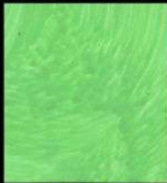
SH 3L0.5 + SH 5L0.5