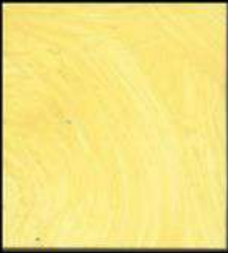
SH 5 A