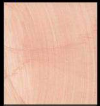
SH 8 B