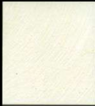
SH 1L0.5 + SH 5L0.5 D