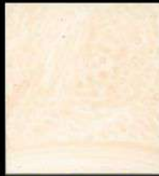
SH 5 L 0.5 + SH 8 L 0.5 C