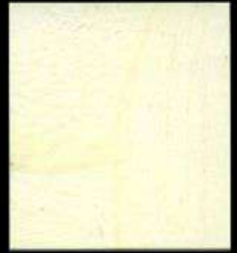
SH 2L0.5 + SH 3L0.5 D