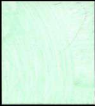
SH 3 C