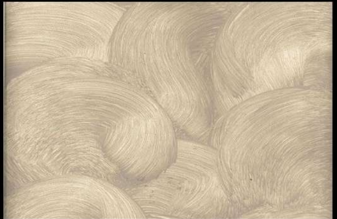
Shadows (Sponge), Shade no. SH1+SH5A