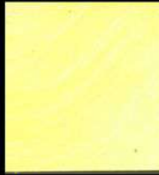
SH 4 A