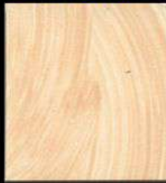
SH 4 L 0.5 + SH 7L 0.5 B