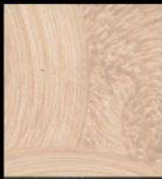
SH 7 B