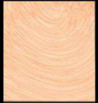
SH 4L0.5 + SH 6L0.5 A