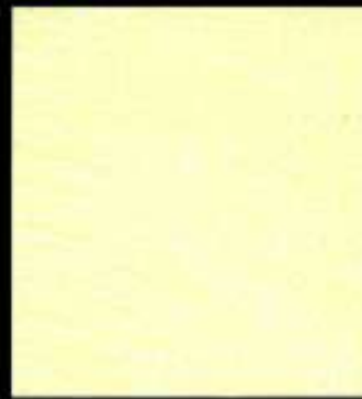
SH 4 B