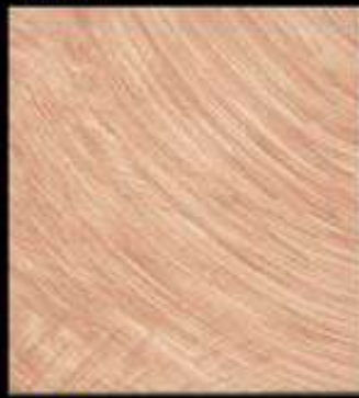
SH 7 A