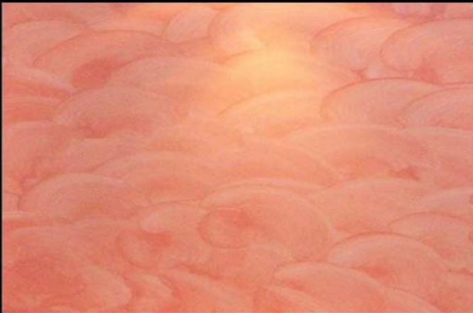
Shadows (Foam Effect)