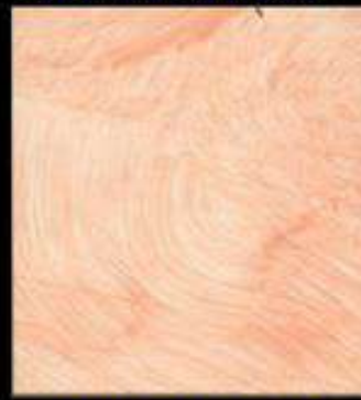
SH 5 L 0.5 + SH 8 L 0.5 A