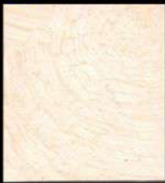
SH 6 B