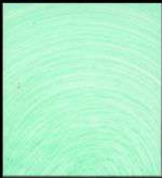
SH 3 B