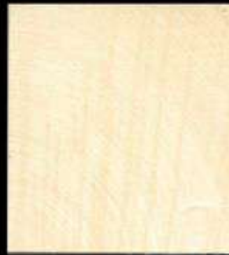
SH 5 L 0.5 + SH 8 L 0.5 D