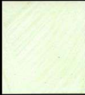
SH 3L0.5 + SH 5L0.5 D