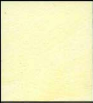
SH 5 C