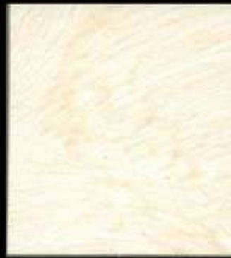
SH 4 L 0.5 + SH 7L 0.5 D