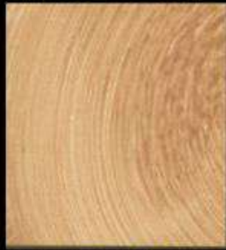
SH 4 L 0.5 + SH 7L 0.5